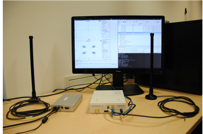
Figure 1: Overview of the demonstration setup. While the GNU Radio receiver is decoding WiFi frames, visitors can interact with the setup by grabbing one of the dipole antennas, move them around, and watch the impact live on the graphical outputs.

http://dx.doi.org/10.1145/2500423.2505300 .